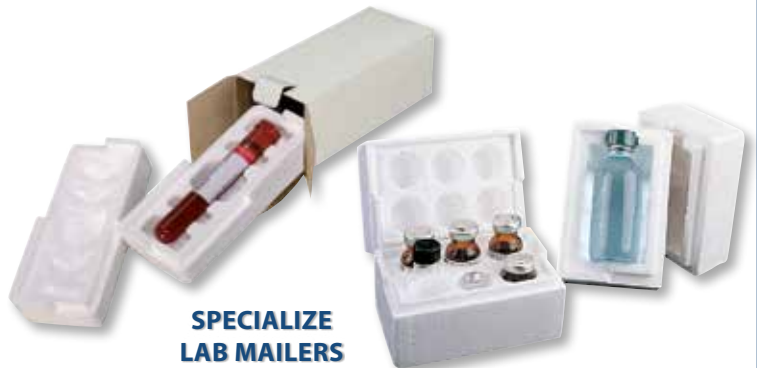
SPECIALIZE LAB MAILERS

We accept all major credit cards and electronic funds transfer, call 815-784-9000